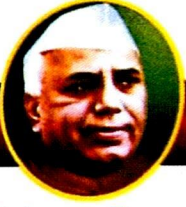
Ion. Yashwantrao Chavansaheb Founder